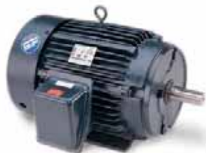
IEEE45 USCG Marine Duty