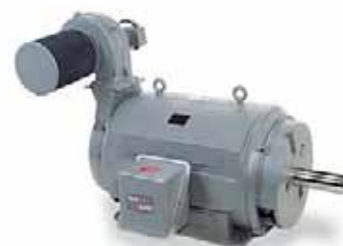
Dripproof Force Ventilated