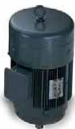
Vertical Solid Shaft