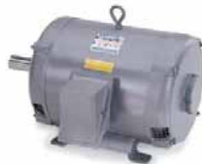
Oil Well Pumping